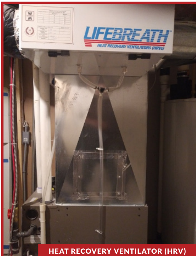
HEAT RECOVERY VENTILATOR (HRV)